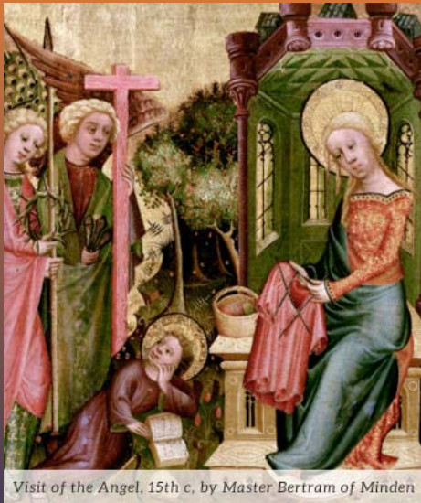
Visit of the Angel, 15th c. by Master Bertram of Minden