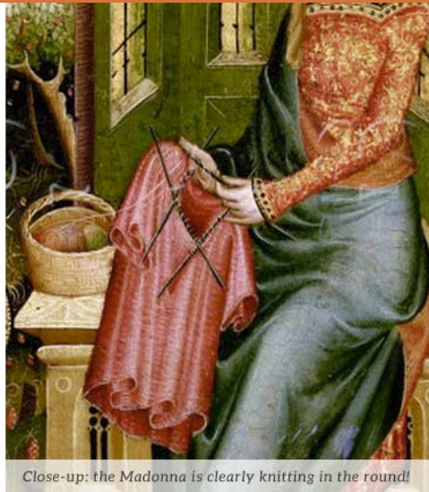
Close-up: the Madonna is clearly knitting in the round!